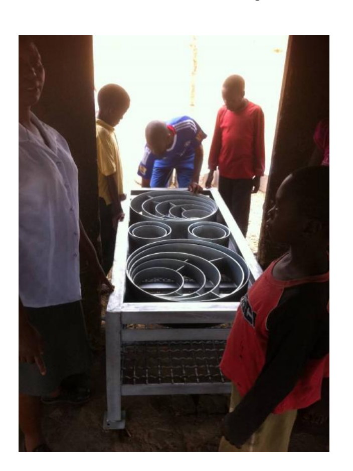
Installation of new stove during renovations.