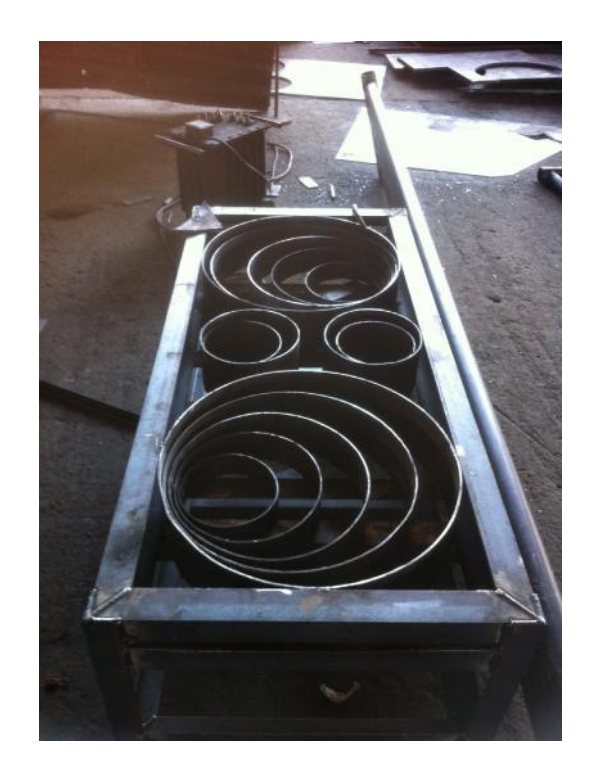
Ten Foundation Developments in 2011