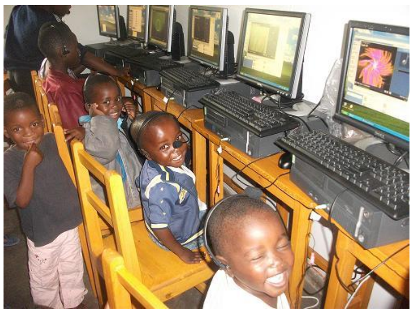
The next improvements planned – trays for the keyboards and cushions for the younger children!