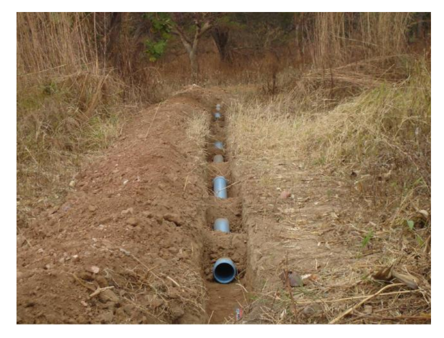
Installation of sewage plumbing during renovations.