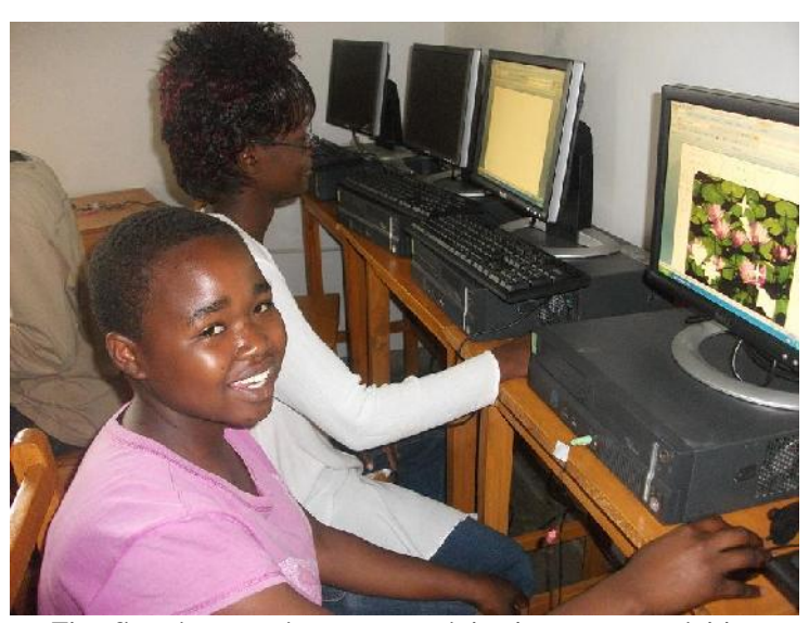
The first instructions were picked up very quickly.

WG Plein 475 1054SH Amsterdam The Netherlands tel.: +31 (0) 20 589 32 32 fax: +31 (0) 20 589 32 20