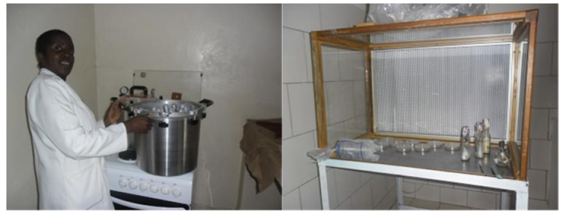
Sterilization of grains, Mushroom culture inoculation unit

Lubumbashi's very own mushroom seed production laboratory has opened this year, thanks to the support of Stichting Ten, Fondation Bralima, the Netherlands Embassy, Cordaid and of course all the project participants and leaders. The mushroom production project community are now trained to create mushroom seed locally. This means that they can sustain their own production without relying on external supplies. It also means that they are able to sell the seed to other people/communities wishing to produce mushrooms.