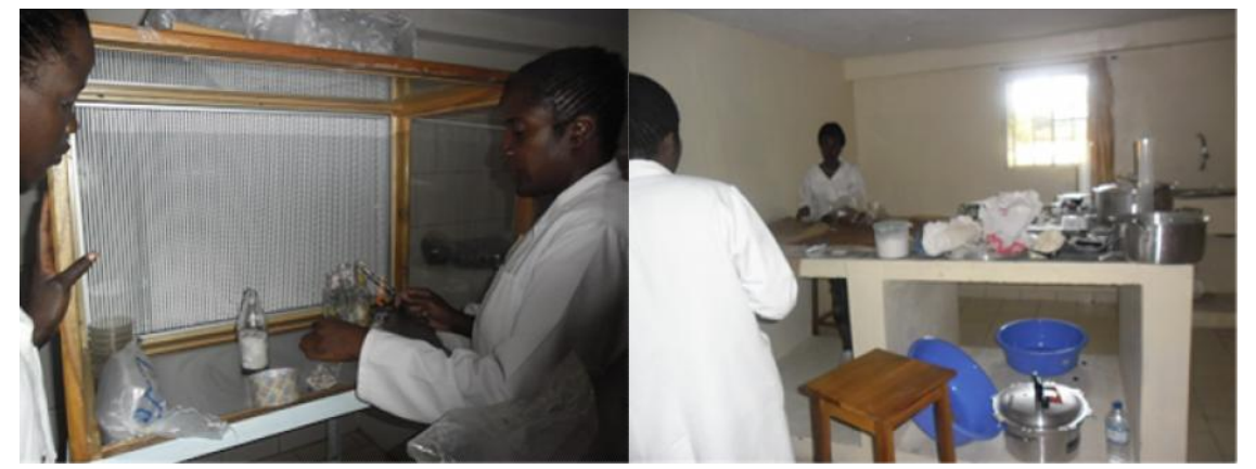
Multiplication of mushroom cultures, Mushroom production project community at work in the seed production laboratory

WG Plein 475 1054SH Amsterdam The Netherlands tel.: +31 (0) 20 589 32 32